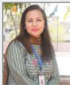
Shehlla Naeem Computer