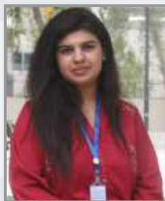
Iqra Ashraf Computer