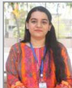
Afya Arif English Language