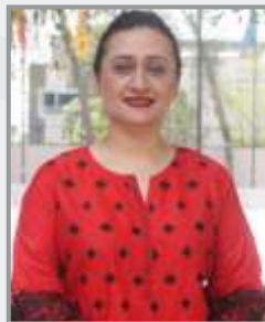
Sadaf Nasir Art