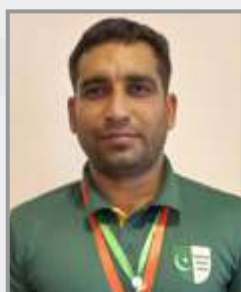
Waseem Abbas Sports