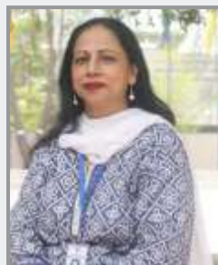
Huma Mehmood Art