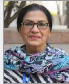
Naveed e Sehr Art