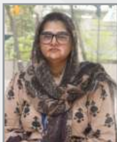
Afifa Maryam Library