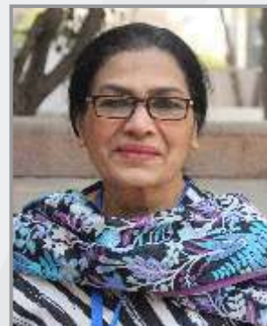
Naveed e Sehr Art & Design