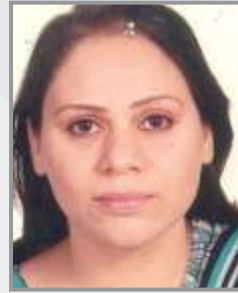
Fakhra Khan Urdu